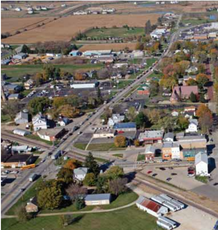
Illinois Route 47 is a vital transportation and commercial corridor for the Village of Huntley, with average daily traffic volumes of 25,000 vehicles.