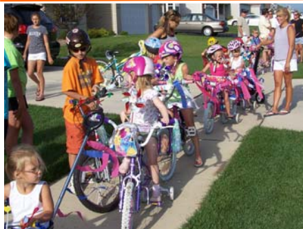
Nearly 50 Children from Georgian Place Subdivision participated in a National Night Out Bike Parade.

The "25 th Annual National Night Out" celebration was held on August 5 th and Huntley residents came out in full force!