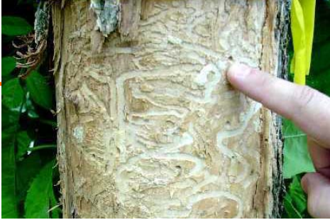
Symptoms of EAB include canopy dieback, D-shaped exit holes, shoots sprouting from the tree trunks and S-shaped larval galleries underneath the bark.