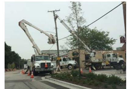
Removal and burial of power lines

Please be sure to visit Downtown Huntley this holiday season to check out the new improvements!