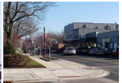
Main Street looking east