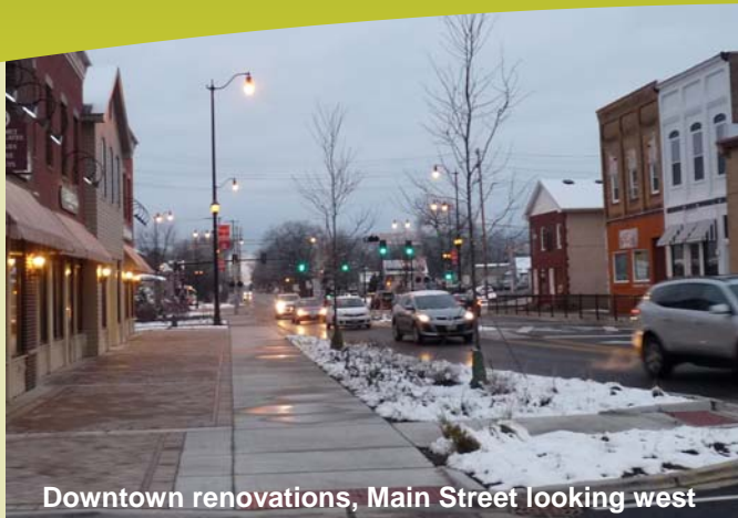
Downtown renovations, Main Street looking west

HUNTLEY The Friendly Village with Country Charm