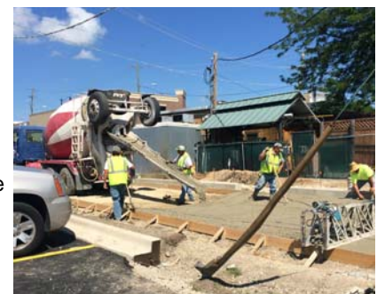
Pouring concrete in the alley