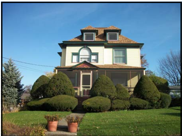
VoH LANDMARK / HISTORIC DISTRICT Designation