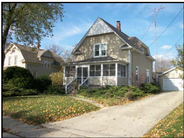
VoH HISTORIC DISTRICT Designation