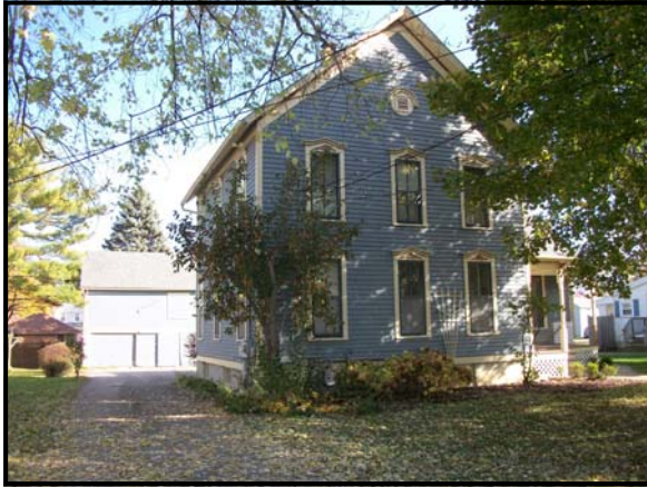
VoH HISTORIC DISTRICT Designation