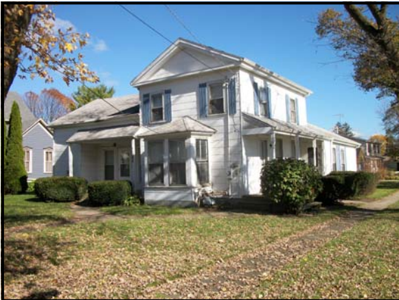
VoH HISTORIC DISTRICT Designation

Village of Huntley Historic District Designation - February, 2009