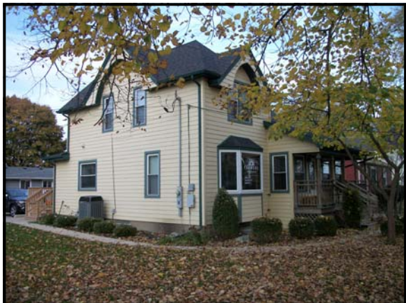
VoH HISTORIC DISTRICT Designation