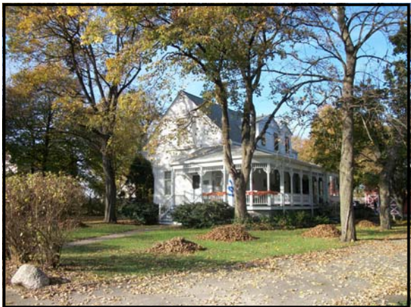
VoH HISTORIC DISTRICT Designation

McHenry County Historical Society Designation - January, 2000