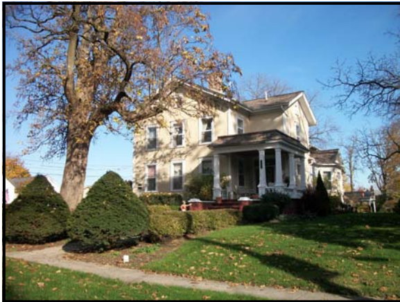
VoH LANDMARK / HISTORIC DISTRICT Designation

McHenry County Historic Preservation Commission Landmark Designation - February, 1999