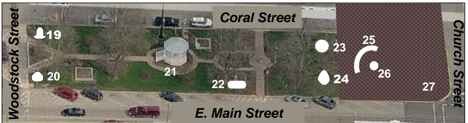
Huntley Town Square Detail Map