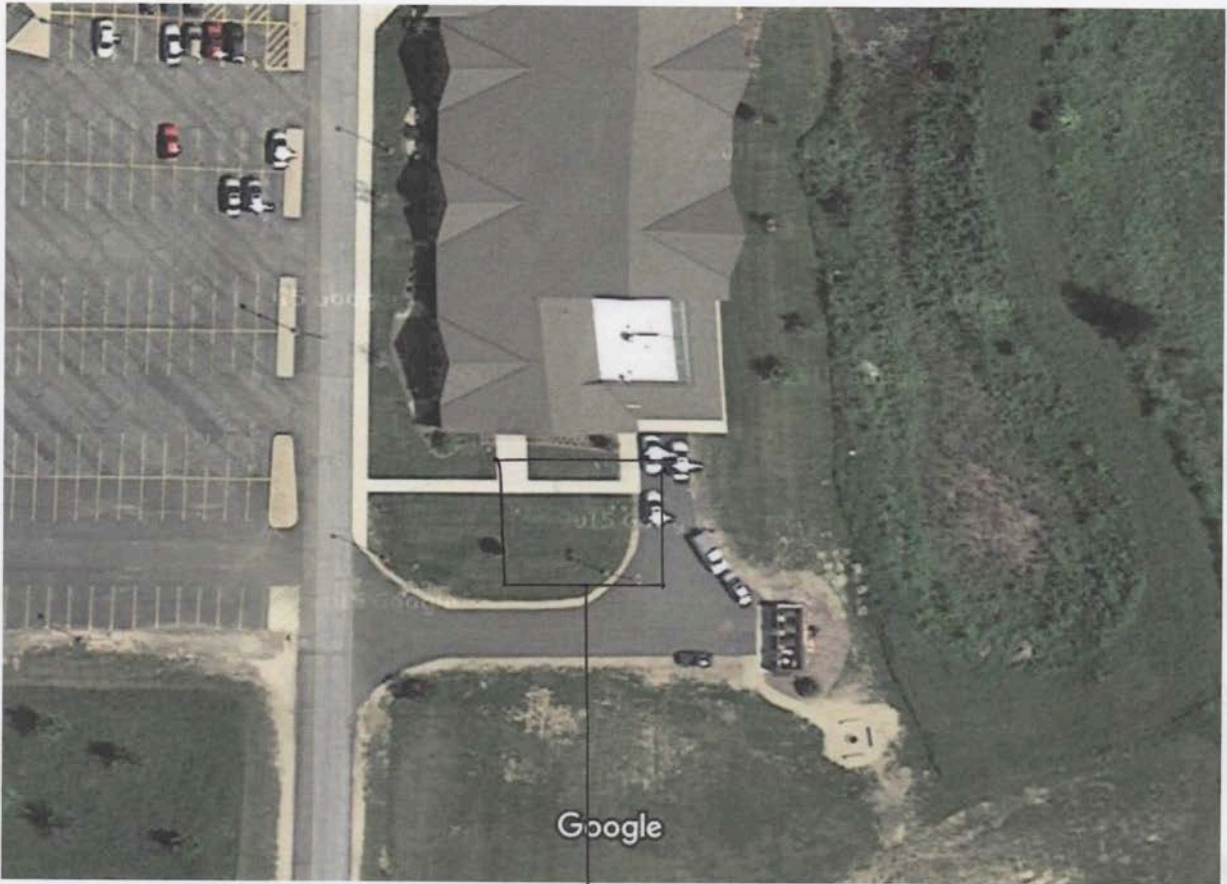
50 ft